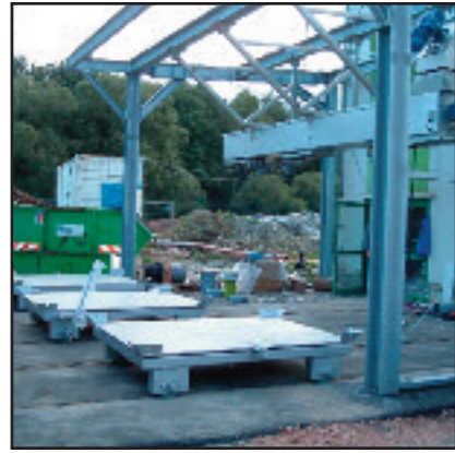
Intelligent solutions for moving and filling containers up to 15 m 3 .